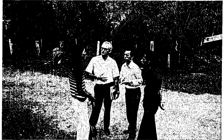
Interaction was a key to the success of the week.